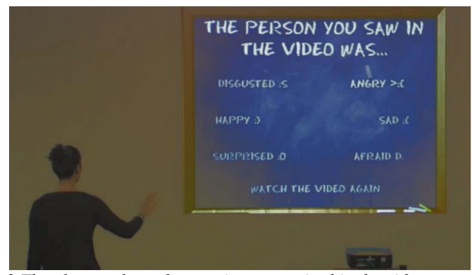
2. The player selects the emotion recognized in the video