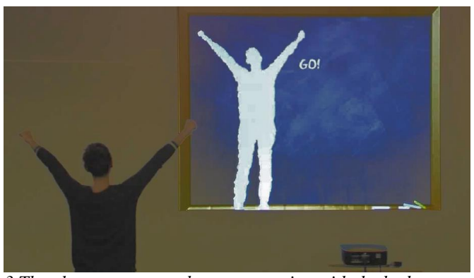
3. The player expresses the same emotion with the body