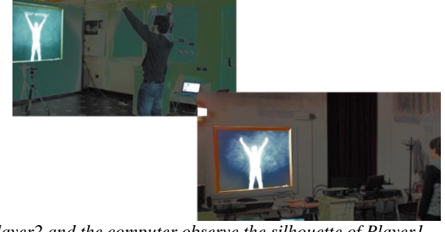
2.Player2 and the computer observe the silhouette of Player1