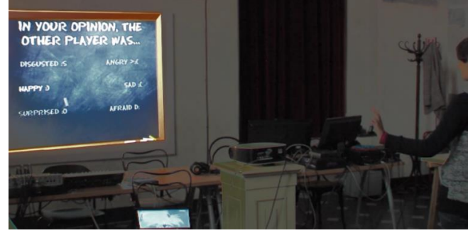
3.Player2 and the computer guess the emotion