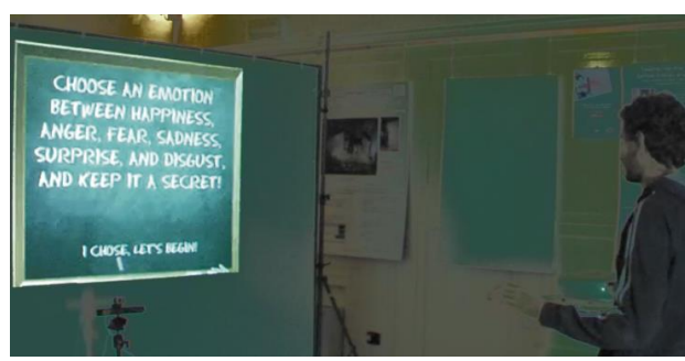
1.Player1 chooses an emotion to express