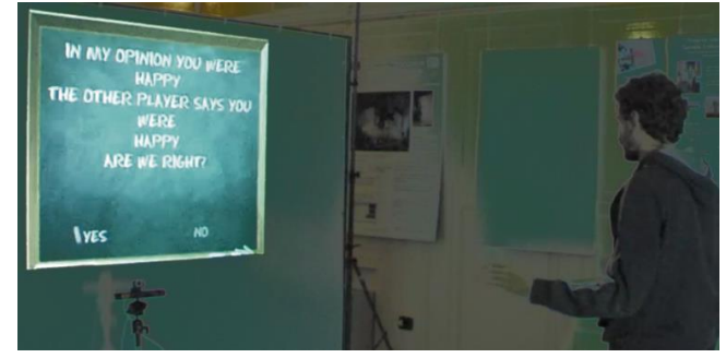
4.Player1 says whether Player2 or the computer gave the right answer