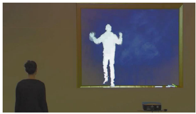
1. The computer shows a video portraying an emotion