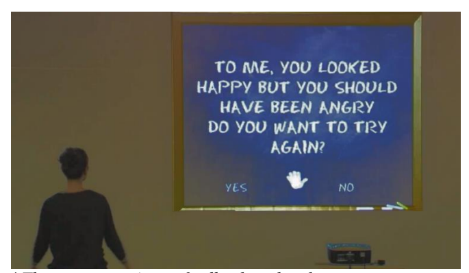
4. The computer gives a feedback to the player